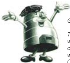
Green Johanna - Hot Composter

Thank you for purchasing a Green Johanna. We hope you will be happy with your purchase. If you have any queries about your product, please contact Green Johanna UK Ltd. Phone number +44 (0) 115 911 4372 where a member of our Sales Team will be able to help. 0800 731 2572 (UK residents only)